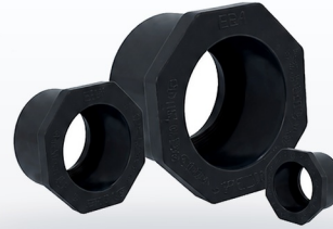
TABLA DE DIMENSIONES